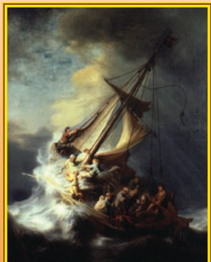
Isabella Stewart Gardner Museum, Boston

from their frames and took them from the Isabella Stewart Gardner Museum in Boston. Experts believe the thieves stashed the Rembrandt in a vault or warehouse. The pieces taken that night are worth as much as $300