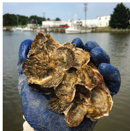
OYSTER RECOVERY PARTNERSHIP

Oyster Recovery Partnership (ORP) will receive the 2023 NMHS Marine Conservation Award in recognition of its commitment to the health of the Chesapeake Bay through the successful restoration of oyster populations. A single adult oyster can filter more than 50 gallons of water a day, and over the past 29 years, ORP has planted a staggering 10 billion oysters. The newly established NMHS Marine Conservation Award acknowledges the exemplary work of those who act as stewards of the oceans, seas, and waterways, including efforts to protect, enhance, and restore ecosystems, promote the sustainable management of marine resources, safeguard and improve the well-being of the communities that depend on these resources, and increase public awareness about the importance of protecting marine environments. ORP, with its broad coalition of partners, works to improve the health of the Bay through aquaculture, shell recycling, community awareness, and support of oyster farming and commercial fisheries to improve the environment and expand economic opportunities in the Chesapeake region. ORP joins previous NMHS maritime environmentalist award winners David Rockefeller Jr. and Sailors for the Sea, Chesapeake Bay Foundation, Conservation International, and the National Geographic Society.