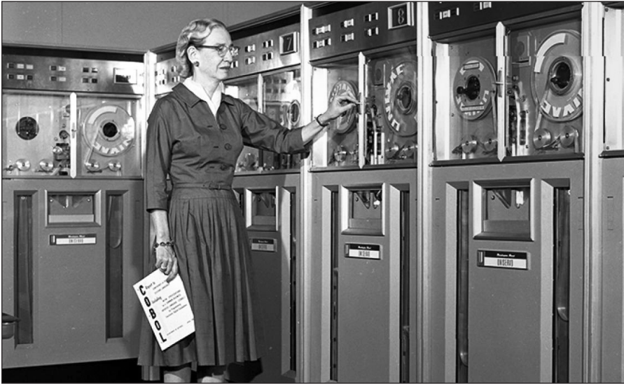
The computers of Grace Hopper's early years in the Navy were massive machines: the Mark I was 51 feet long by 8 feet high by 2 feet deep. (above) Grace Hopper demonstrates a UNIVAC computer. (right) In the late 1960s, she used bundles of wire "nanoseconds" to demonstrate how designing smaller components would produce faster computers.