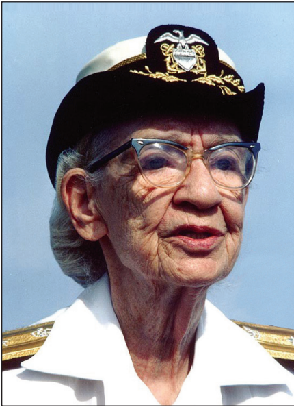
Rear Admiral Grace M. Hopper, USN

In 1983 Grace Murray Hopper, then seventy-six years old, was made an admiral in the US Navy by special presidential appointment. Four years later, the Navy named its new computer center in San Diego for her, and in 1996, four years after her death, it christened its newest Arleigh Burke class destroyer USS Hopper (DDG 70). The recipient of numerous medals, awards, and honorary degrees, Grace Hopper was esteemed both for her giant intellect and for her unceasing energy. As befits a leader instrumental in creating a whole new discipline, her message to everyone was, above all, to innovate and