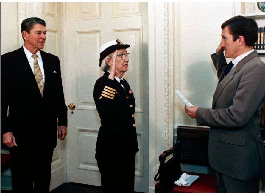
P. 24

Capt. Grace M. Hopper takes the oath of office from Secretary of the Navy John Lehman, during White House ceremonies promoting her from the rank of Captain to Commodore, 15 December 1983. President Ronald Reagan looks on.