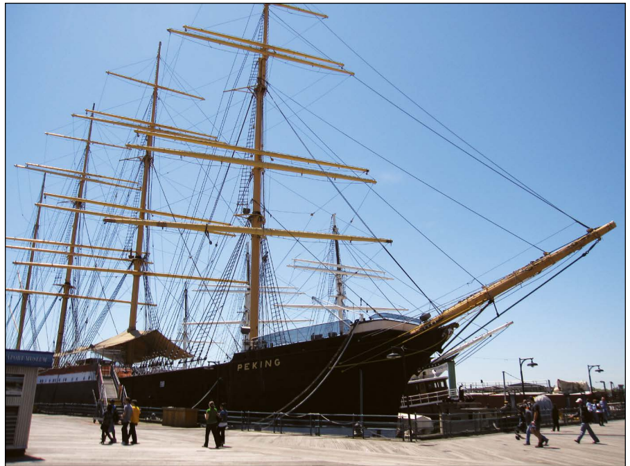
Peking at her berth on South Street in New York City.

After the Manhattan-based maritime museum determined it could not afford to maintain two massive tall ships, a conversation was initiated with the German government about its interest in taking possession of the ship. Although she has become a New York icon because of how long she has been berthed at South Street, Peking had no connection during her working life with New York. But she had a long career at sea and is emblematic of the great shipbuilding tradition in Hamburg, and in time the Germans agreed to take her. Last November, the German government allocated 30 million euros, approximately $3.3 million, to bring Peking home and restore her as a dockside attraction. The planned German Port Museum project is budgeted at 120 million euros ($13 million).